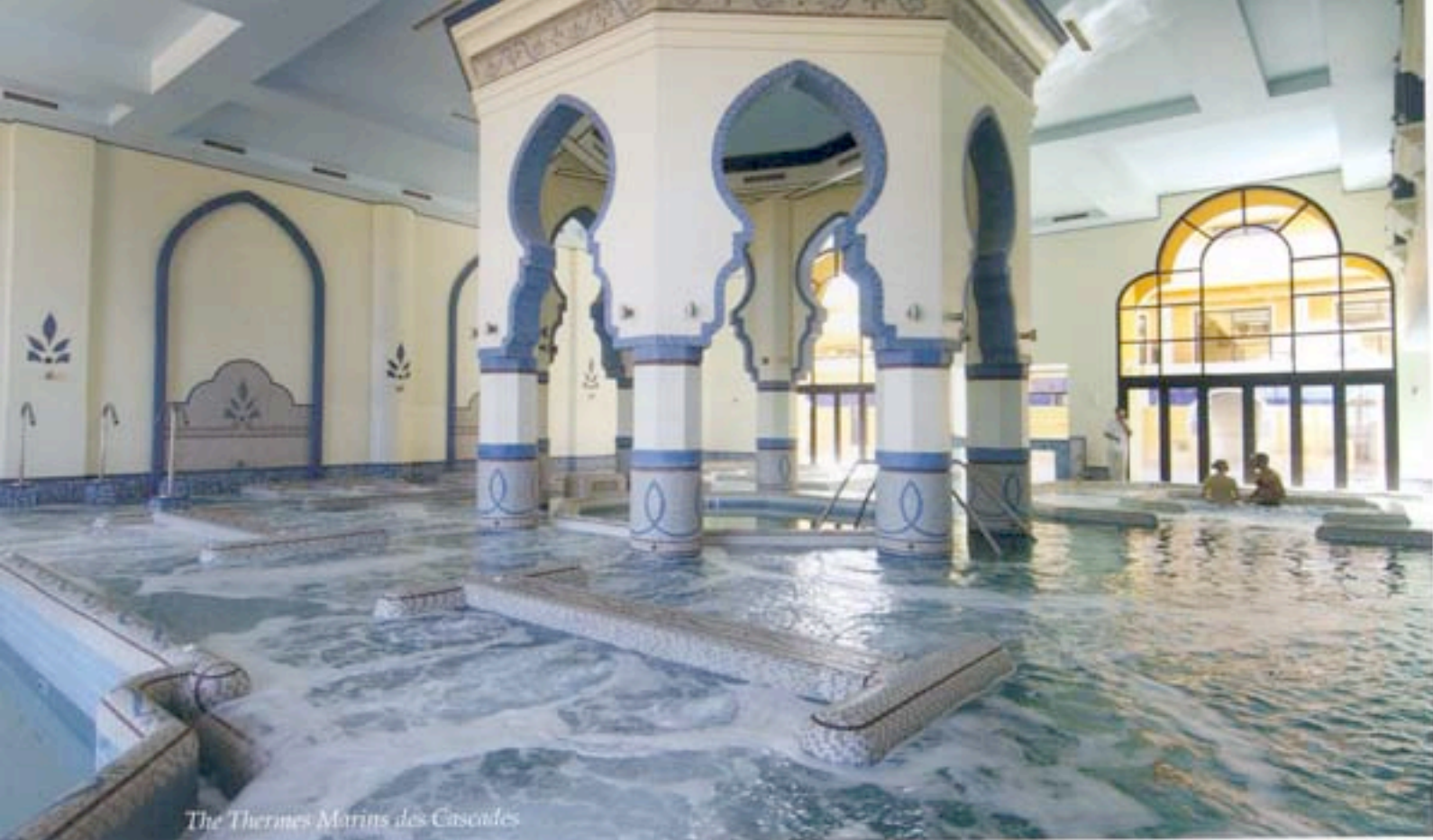
The Thermes Murrins des Cascades